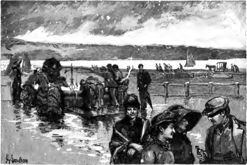
AT THE FOUNTAIN OF BLESSED WATER.

A boat laden with pilgrims from the Isle of Orleans is making for our shore, and the voices rise and fall with the dip of the oars in the true rhythm of the canotier :